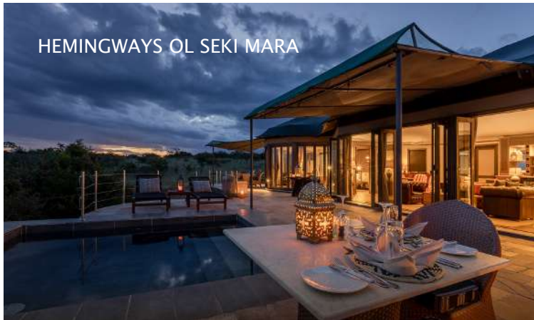
HEMINGWAYS OL SEKI MARA