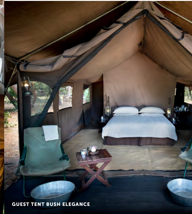
GUEST TENT BUSH ELEGANCE