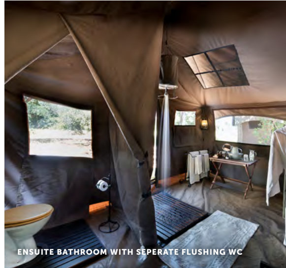
ENSUITE BATHROOM WITH SEPERATE FLUSHING WC

Each under-canvas tent is mindfully designed to bring you as close to nature as possible, with little impact on the environment.