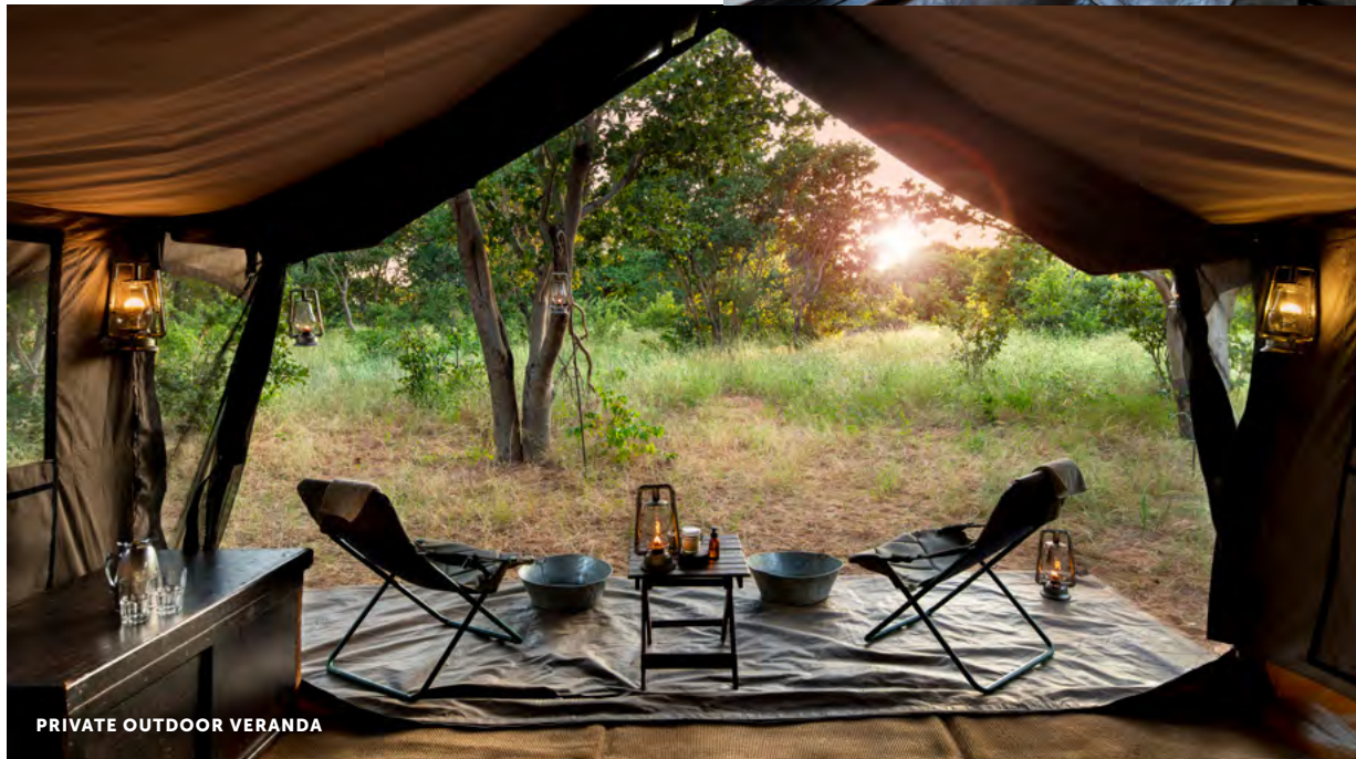
PRIVATE OUTDOOR VERANDA