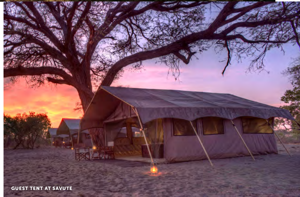
GUEST TENT AT SAVUTE