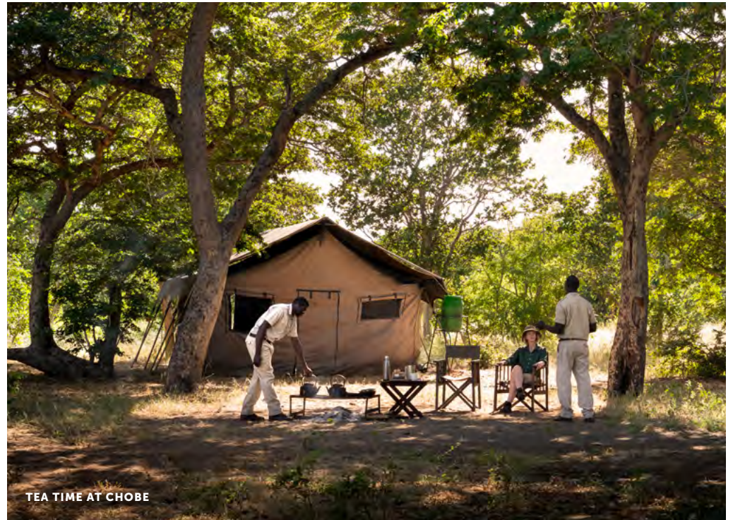
TEA TIME AT CHOBE

Savute, a remote and wild corner of Chobe National Park, stretches from the park's northern boundaries to the Linyanti River. It is named after the enigmatic Savute Channel, which flows and dries up intermittently, seemingly unrelated to rainfall. Our exclusive semi-permanent campsites are ideally based in the expansive Savute corner of the park near the Savute Channel. Moving every few days to a new campsite, our &Beyond Savute Under Canvas camp features five canvas safari tents, each with a comfortable double or twin bed, an ensuite bathroom with a separate flushing WC and steaming hot bucket shower.