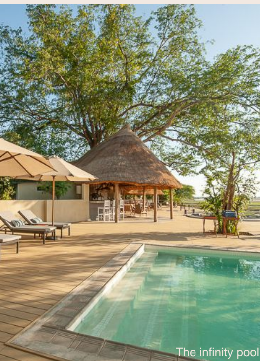
The infinity pool

Established for over 25 years, Kafunta is a distinctive Zambian safari lodge with a contemporary touch; it combines all the ingredients to create an exceptional safari. Here you will find the rest and peace you need after an exciting day in the bush in combination with attentive service and a warm welcome by our team.