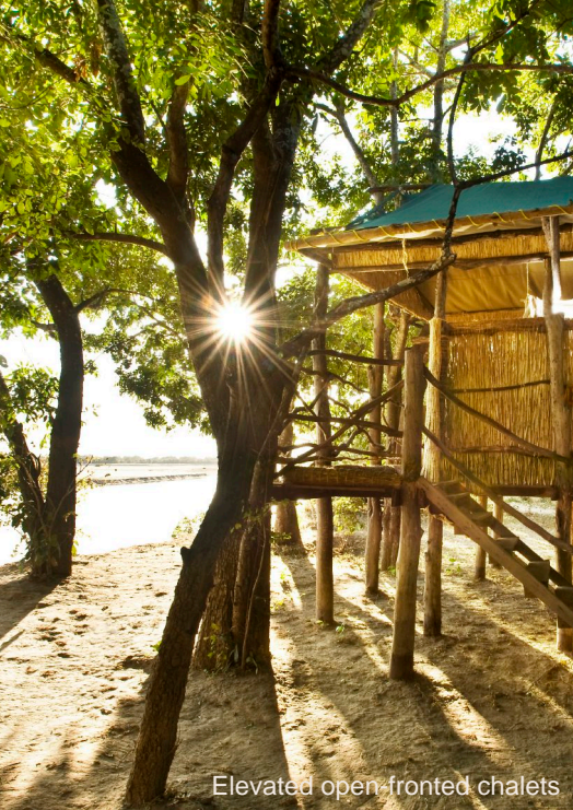
Elevated open-fronted chalets

Island Bush Camp is our charming authentic camp, located well off the beaten tracks and immersed in pure wilderness. The camp is set under the cool shade of old mahogany trees on the banks of the Luangwa River.