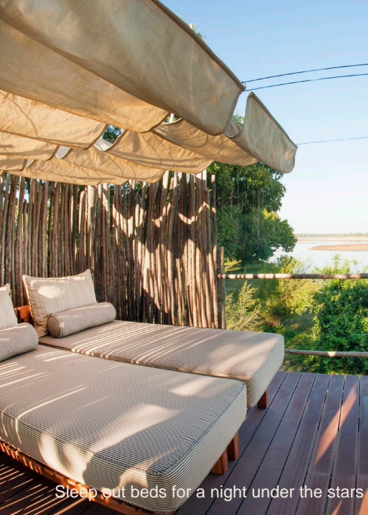
Sleep out beds for a night under the stars