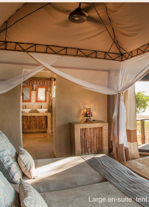
Large en-suite tent

Three Rivers Camp is an absolute gem of a tented camp. The drive to the camp is a mere 2 hours from Kafunta, heading south and passing through dense mopane forests and remote villages while bordering the national park.