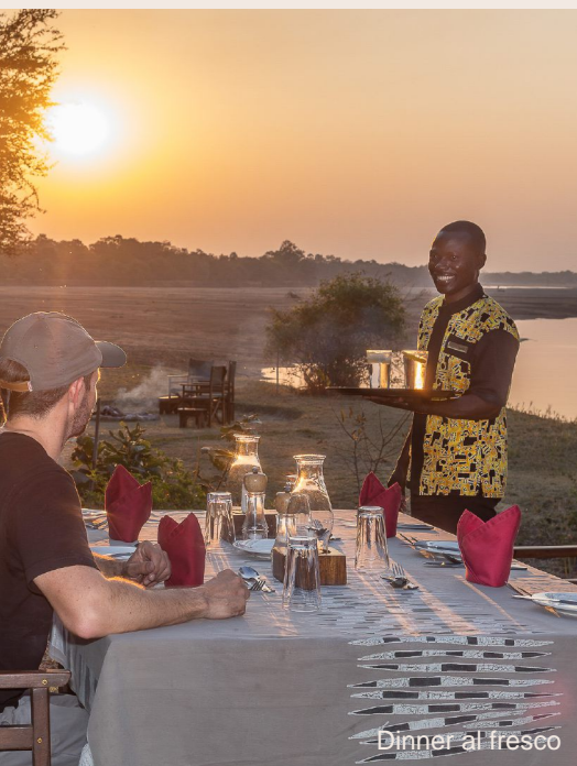
Dinner al fresco

Sitting in the hide, observing them bathing is pure serenity. Make sure to spend some time there, immersing yourself in the heart of nature's beauty.