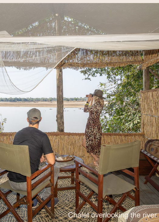
Chalet overlooking the river