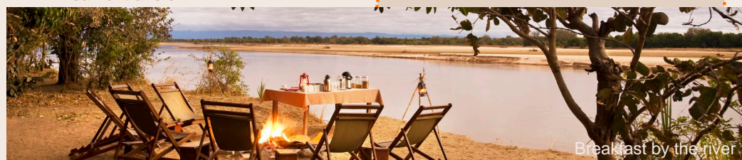
Breakfast by the river