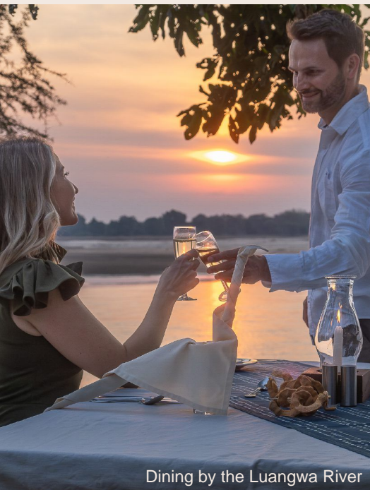
Dining by the Luangwa River