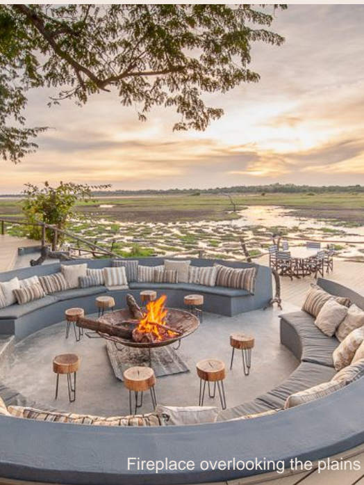
Fireplace overlooking the plains