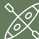
Guided Canoeing - No Children under 16 yrs - (additional charge)