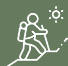
Guided Game Walks - No Children under 16 yrs - (additional charge)