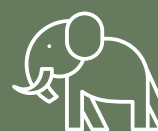
Guided Game Drives