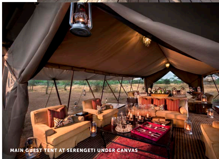
MAIN GUEST TENT AT SERENGETI UNDER CANVAS