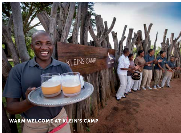
WARM WELCOME AT KLEIN'S CAMP

Deep in a remote corner of the game-rich Serengeti National Park, a 10 000 hectare (24 700 acre) wildlife concession leased from Maasai landlords offers guests the ultimate, exclusive, Tanzanian safari. Night drives and walking safaris in the private concession allow guests to explore the nocturnal world of predators or to get an intimate glimpse into the details of the African bush.