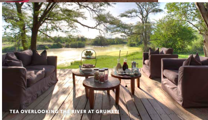
TEA OVERLOOKING THE RIVER AT GRUMETI