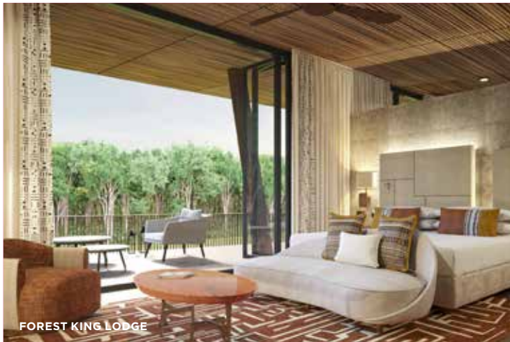
FOREST KING LODGE