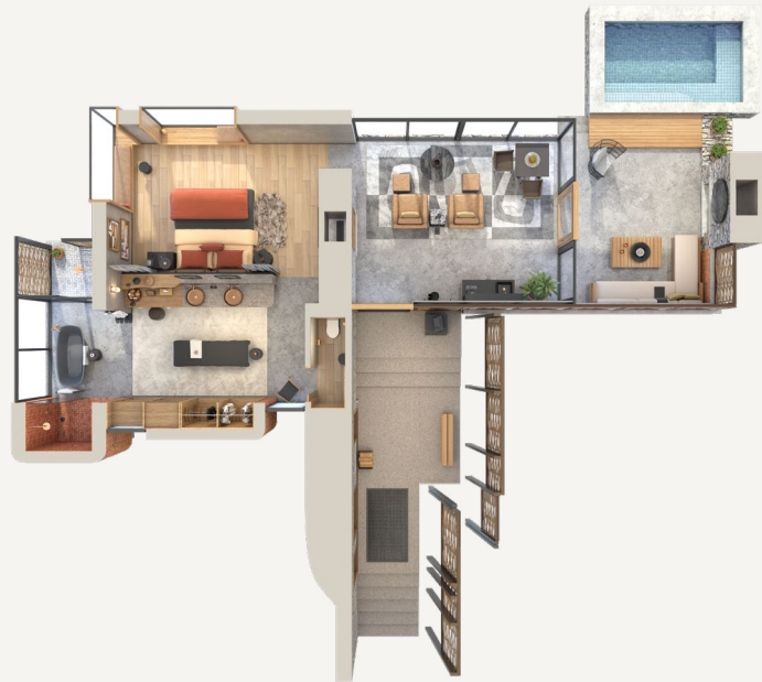
7 X ONE-BEDROOM SUITES