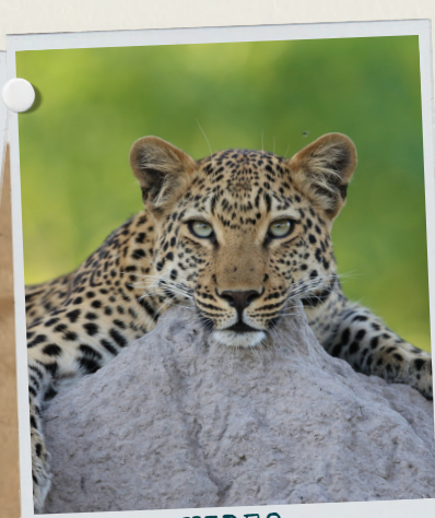
VIDEO Film something extraordinary? We can't wait to see!