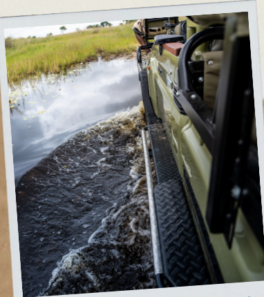
ESSENCE OF KWANDO Share your favourite moments or portraits of our family