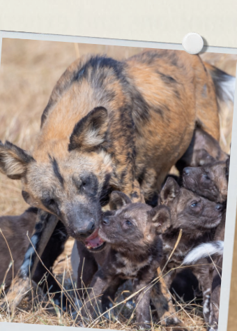
NEW LIFE The cutest category

No employees of Kwando may enter the competition, although there will be a prize for the guide who guided the winner.