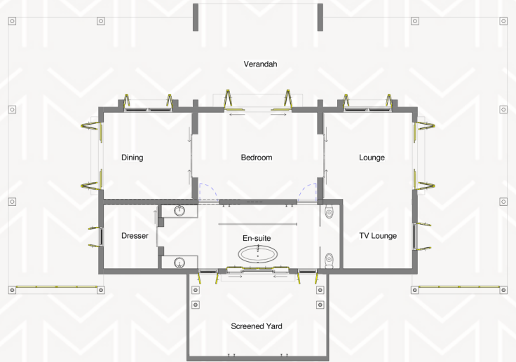
Mutota Forest Villa Over 200sqm of living space