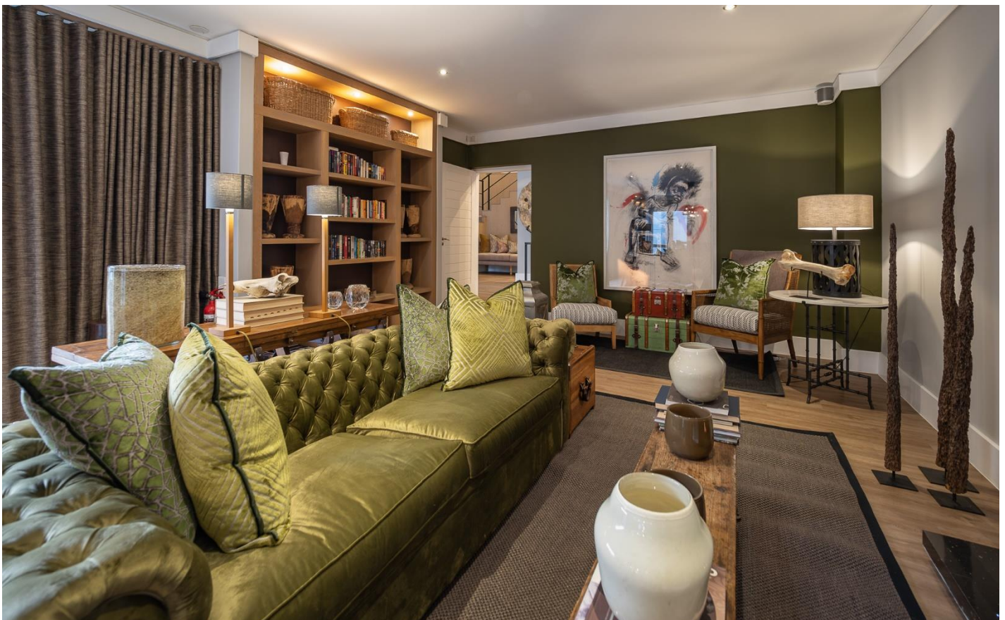
AtholPlace Hotel – bar & library