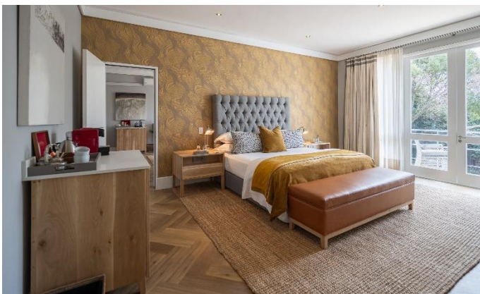
Deluxe Room (interleading) – AtholPlace Hotel