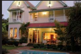
HACKLEWOOD HILL COUNTRY HOUSE