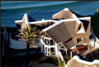
THE SANDS @ ST FRANCIS