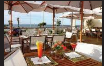
GINGER - THE RESTAURANT