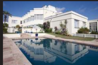
THE BEACH HOTEL