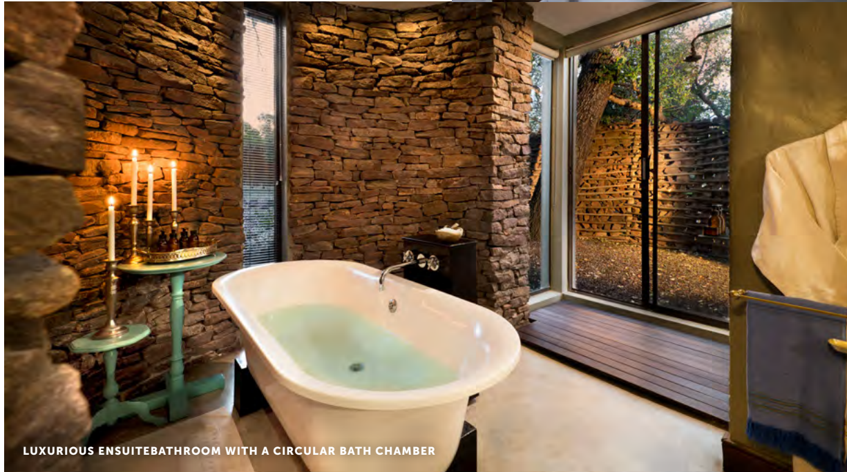
LUXURIOUS ENSUITE BATHROOM WITH A CIRCULAR BATH CHAMBER