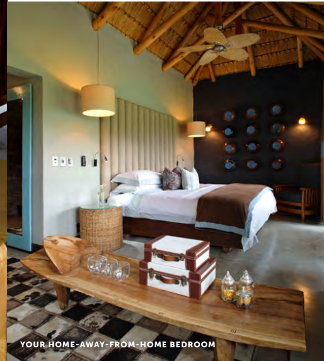
YOUR HOME-AWAY-FROM-HOME BEDROOM