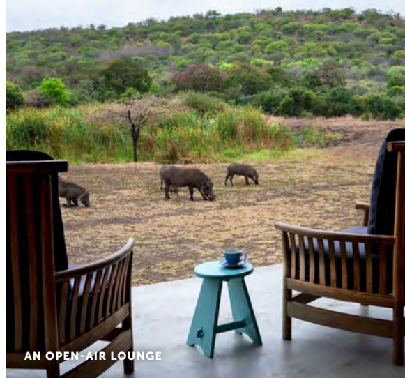
AN OPEN-AIR LOUNGE

Just four individual thatched Zululand bush Suites, make up this intimate lodge that can be reserved as a sole-use villa for private gatherings, or on an individual room booking.