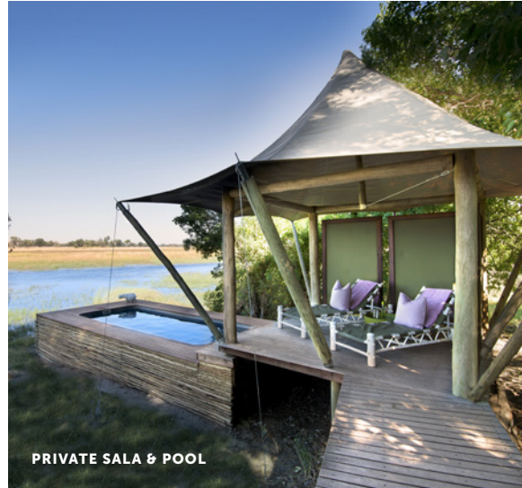
PRIVATE SALA & POOL

Designed to keep you close to nature, be captivated by spectacular views over the Delta and hear all the sounds of the wild from the comfort of your chic tented suite.