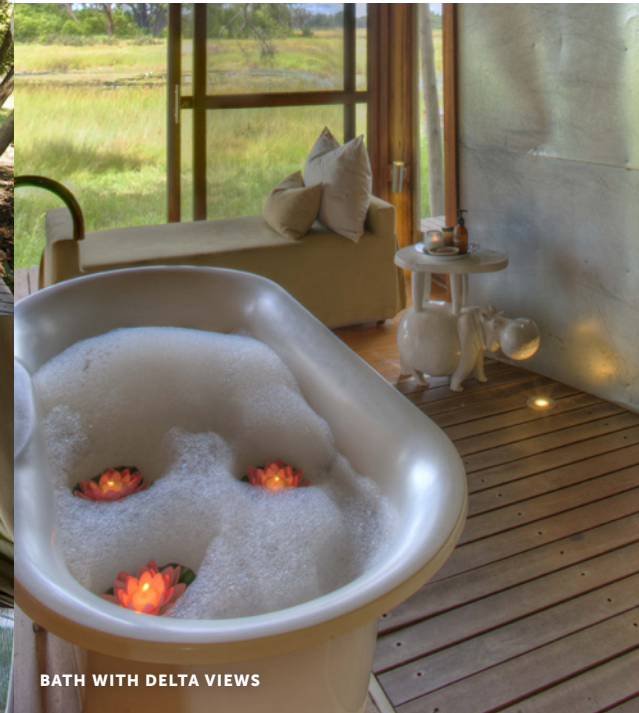
BATH WITH DELTA VIEWS