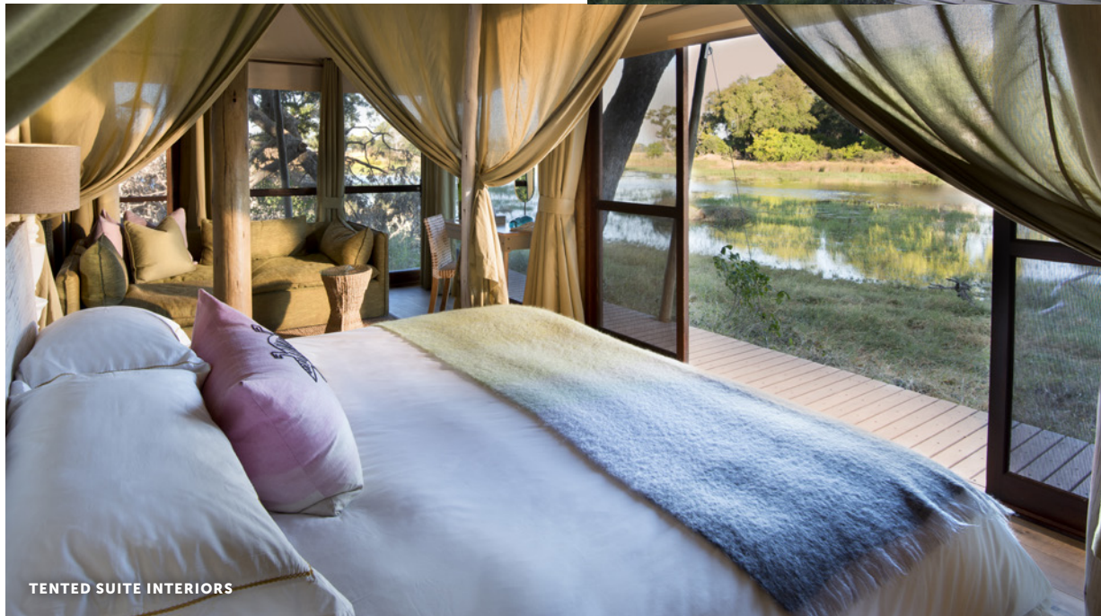
TENTED SUITE INTERIORS