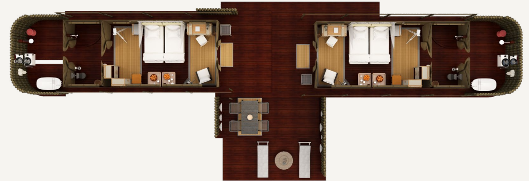
2 X TWO-BEDROOM FAMILY TENTS