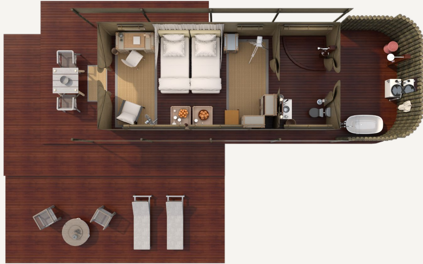
4 X ONE-BEDROOM TENTS