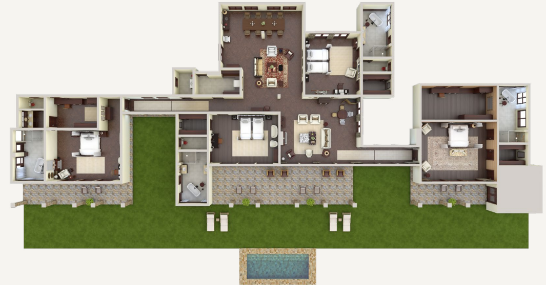
1 X FOUR-BEDROOM COTTAGE