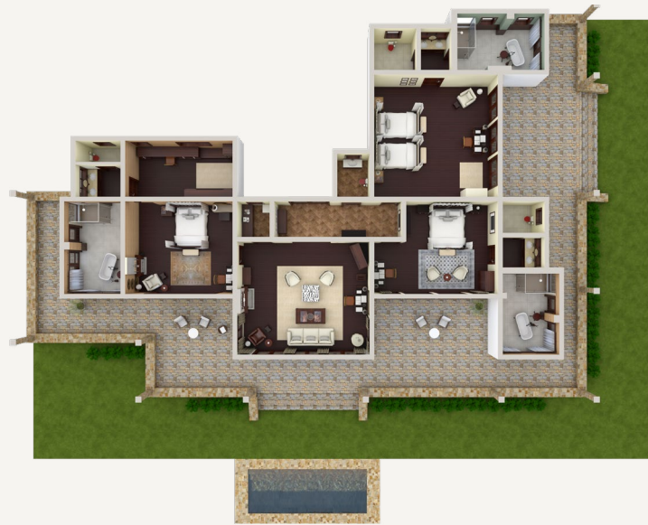
1 X THREE-BEDROOM COTTAGE