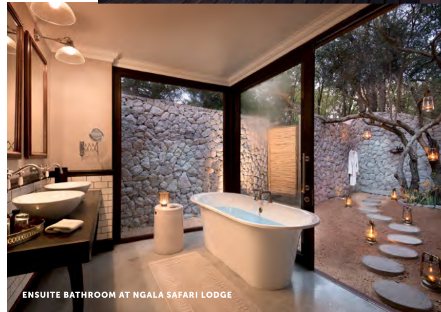
ENSUITE BATHROOM AT NGALA SAFARI LODGE