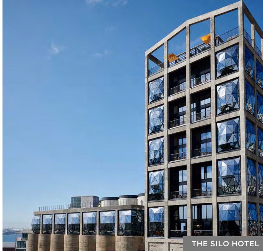
THE SILO HOTEL