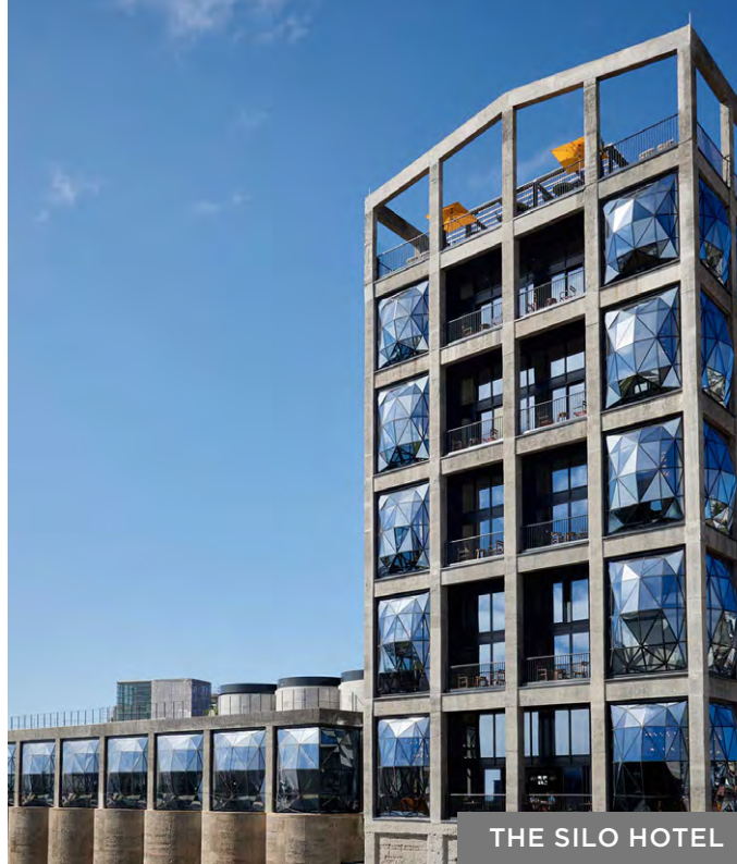
THE SILO HOTEL

Suite 101 Intaba, 25 Protea Road, Claremont, 7708, South Africa