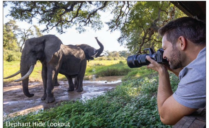
Elephant Hide Lookout

*Please ask reservations for our list of local excursions outside the reserve