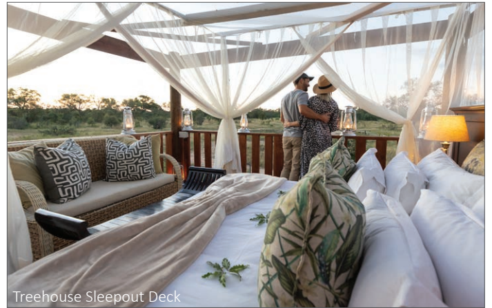
Treehouse Sleepout Deck

The Tintswalo Treehouse experience may be booked as an add-on experience by Tintswalo Manor House guests. Cost: R2 750 per person, including a romantic dinner for two.