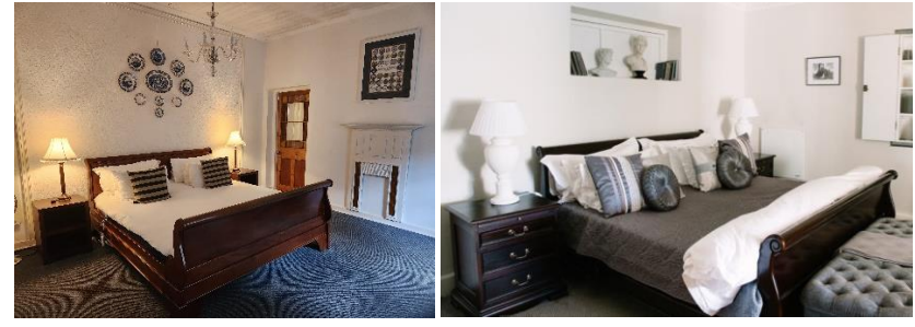
ROOM 9 ~ Blue & White Plate Room

These Suites are a little more private and are a little further away from the hotel. Room 7 has 2 x Lounges and 2 x Fireplaces. Room 9 has 2 x bathrooms (a "his" and a "hers". Mountain and garden views. Both Suites have King-size beds.