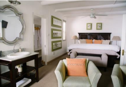
ROOM 12 ~ Herb Room