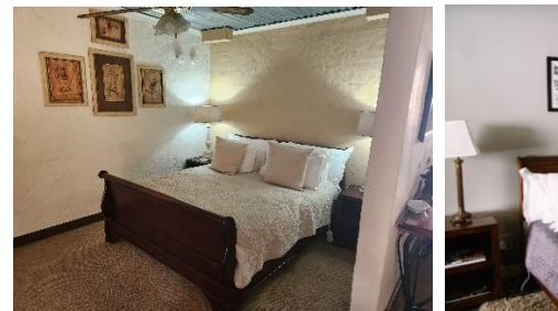
ROOM 1 ~ Italian Room

Room 1 is adjoining the standard rooms; Room 8 and Room 12 a little further away from the hotel. Separate sitting area from the bedroom. These are slightly bigger than the Standard Rooms. Views of the mountain and gardens. Fireplaces in each Suite.