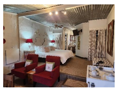
ROOM 2 ~ Scandinavian Room

Closer to the hotel, rooms looking out onto the dam. Open plan sitting and bedroom area, with fireplace, en-suite bathroom and separate toilet. King size beds or twin beds in selected rooms. Room 2,4 and 5 can be twinned.