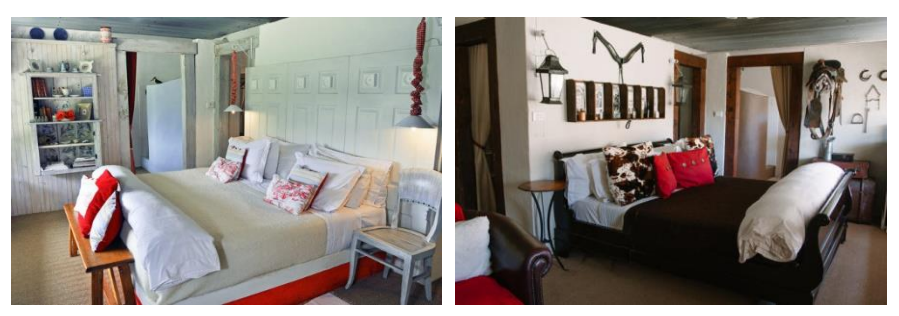
ROOM 10 ~ Swedish Room

Stand-alone private units, away from the main hotel. Each cottage has a patio overlooking the wetland with glorious views of Mt. Lebanon. Spacious, open plan lounge and bedroom area with a fireplace. Separate dressing room, separate toilet and en-suite bathroom.