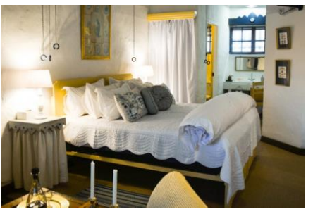
ROOM 4 ~ Darjeeling Room