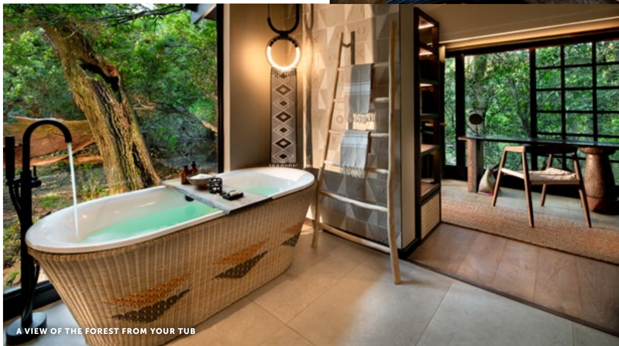
A VIEW OF THE FOREST FROM YOUR TUB