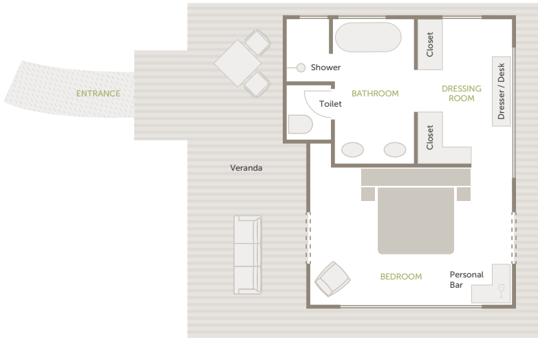
Typical Suite layout