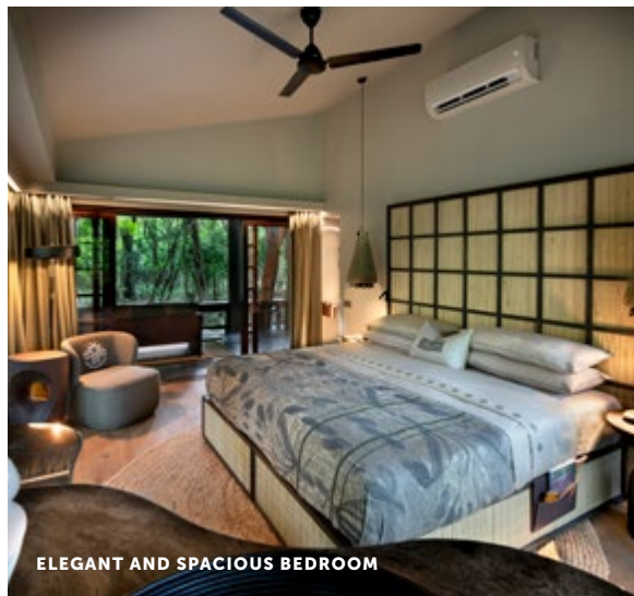
ELEGANT AND SPACIOUS BEDROOM

Set in a rare and beautiful sand forest, the glass walls of Forest Lodge's 16 air conditioned Suites offer a sweeping view of one of the most unique ecosystems on the planet.