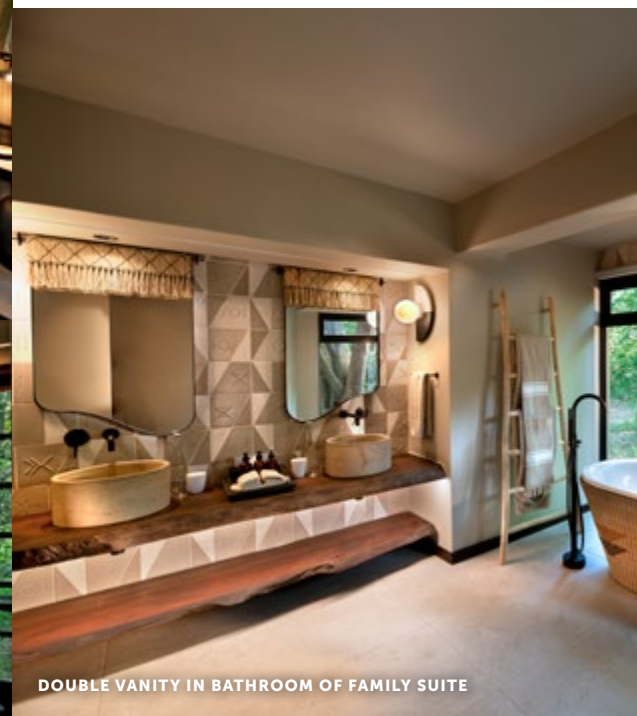
DOUBLE VANITY IN BATHROOM OF FAMILY SUITE