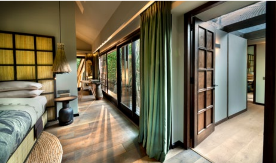
Family Suite layout