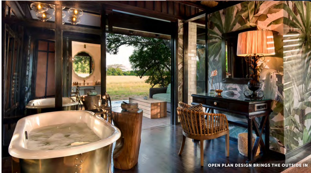
OPEN PLAN DESIGN BRINGS THE OUTSIDE IN