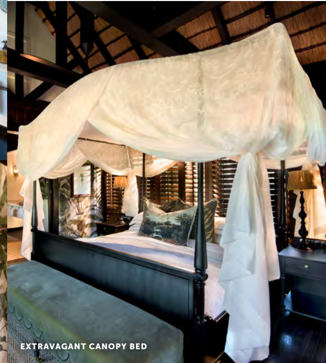
EXTRAVAGANT CANOPY BED