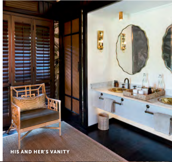
HIS AND HER'S VANITY

Set on the edge of a sand forest, and overlooking a vast grassy meadow, each of the six thatched Suites ensure exclusivity and incredible wildlife sightings.