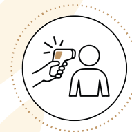
Thermal Screening at entrance points.