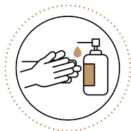
Hand Sanitizing stations at all entrances.