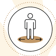
Social Distancing practice in all areas.