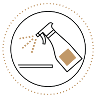
Increased cleaning and disinfection frequency.

As we reopen our Hotels/Lodges/Camps and Resorts and to ensure Guest Safety with the current COVID-19 pandemic, we have elevated our Safety Protocol even further by launching the “ Wellworth Salama ” – Cleanliness & safety initiative which represents some of the most stringent cleaning standards & operational protocols so as to ensure guest’s safety and peace of mind from check-in to check-out.