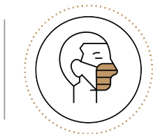
Use of Personal Protective Gear and adherence to general Hygiene required standards.