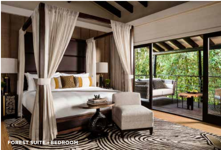
FOREST SUITE - BEDROOM