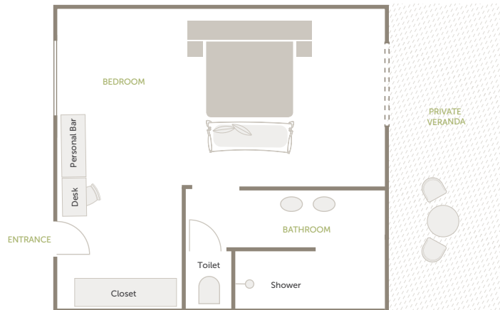
Typical Cottage layout