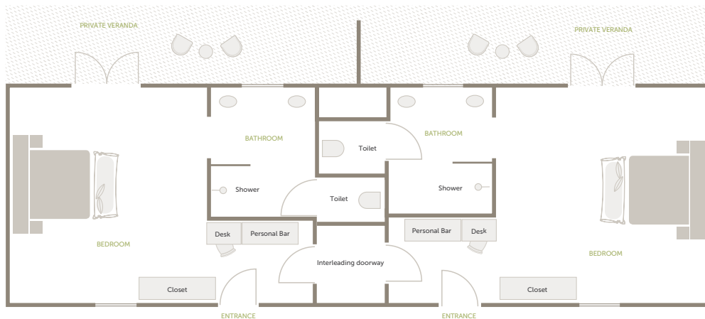
Family Cottage layout

Maximum two adults and two children (three children on request – third child must be 3 – 16 years old)