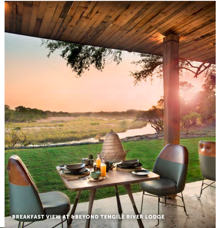
BREAKFAST VIEW AT &BEYOND TENGILE RIVER LODGE

Situated in a perfect position on the banks of the Sand River, with panoramic river views from every vantage point, lies Tengile River Lodge. Meaning 'tranquil' in the local language, the lodge certainly has an advantage over all others in the Sabi Sand Nature Reserve. This spectacular lodge features nine enormous, air-conditioned, secluded Suites (including a Family Suite); sensitively nestled, unlike any other lodge in the Sabi Sand, within the riverine forest offering unparalleled close views of the Sand River. In addition to a master bedroom, bathroom and outdoor shower in each Suite, there is a lounge, dining area, fully-stocked bar, coffee station and outdoor seating and dining area that is guaranteed to take your breath away. A private lap pool on your spacious private deck comes complete with sunken outdoor lounge looking out onto the famed Sand River.