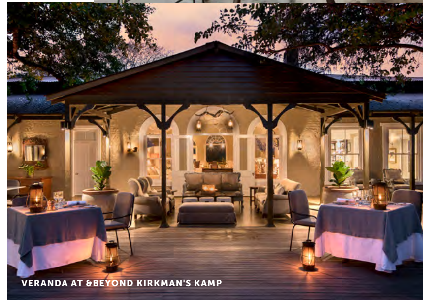
VERANDA AT &BEYOND KIRKMAN'S KAMP