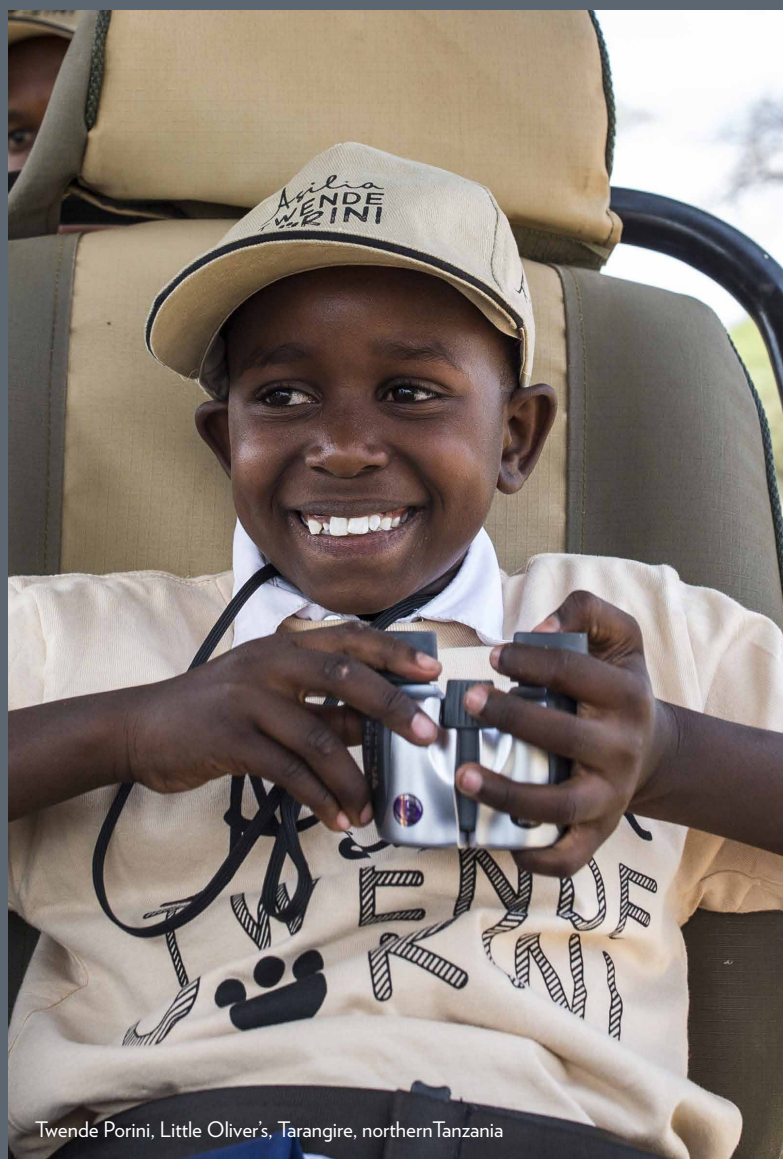
Twende Porini, Little Oliver's, Tarangire, northern Tanzania