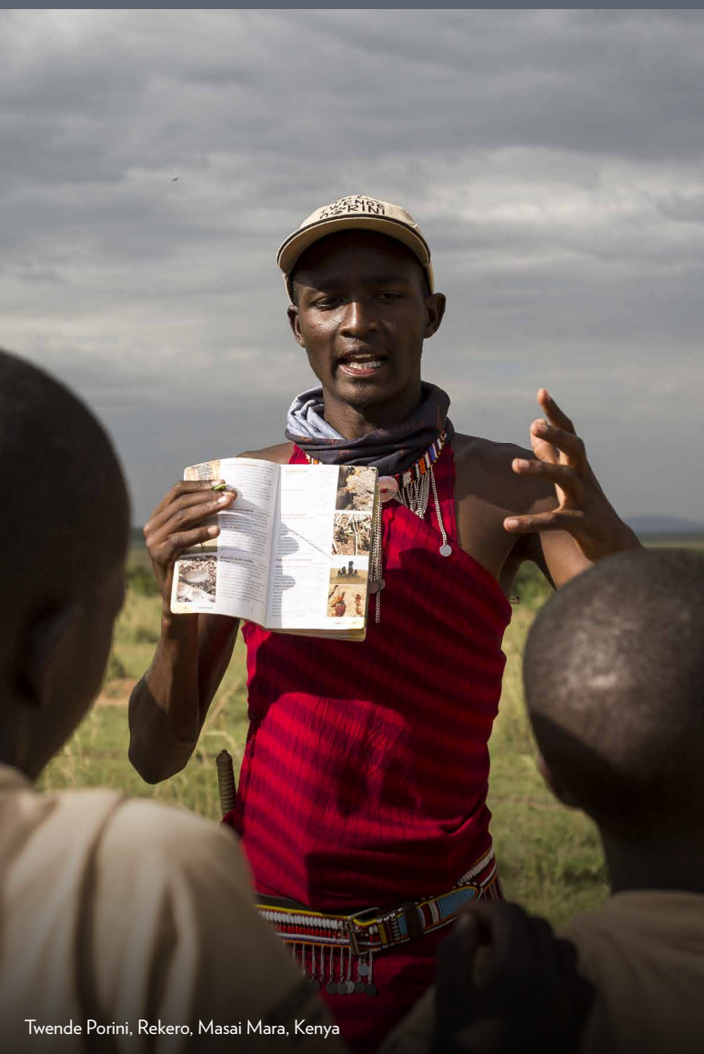
Twende Porini, Rekeru, Masai Mara, Kenya

We acknowledge that people and nature are inseparable partners, so we work closely with communities, authorities, NGOs and industry partners to achieve the best possible long-term outcomes for all concerned.