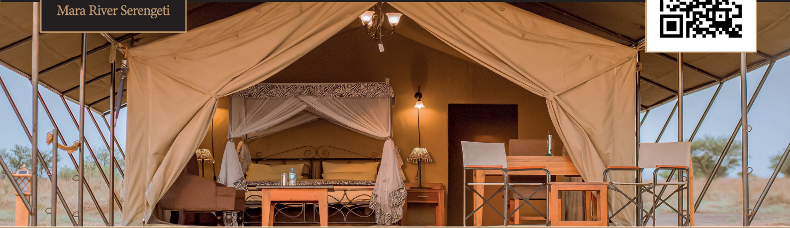
Scan to visit our webpage