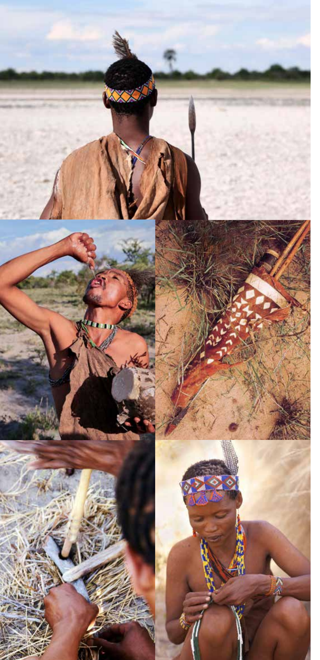
DAY 4 Spend the morning walking with the Zu/'hoasi Bushmen.

We passionately support cultural tourism in Botswana. It has long been our belief that it is a vitally important tool in terms of preserving this unique, but sadly fast-vanishing, culture.