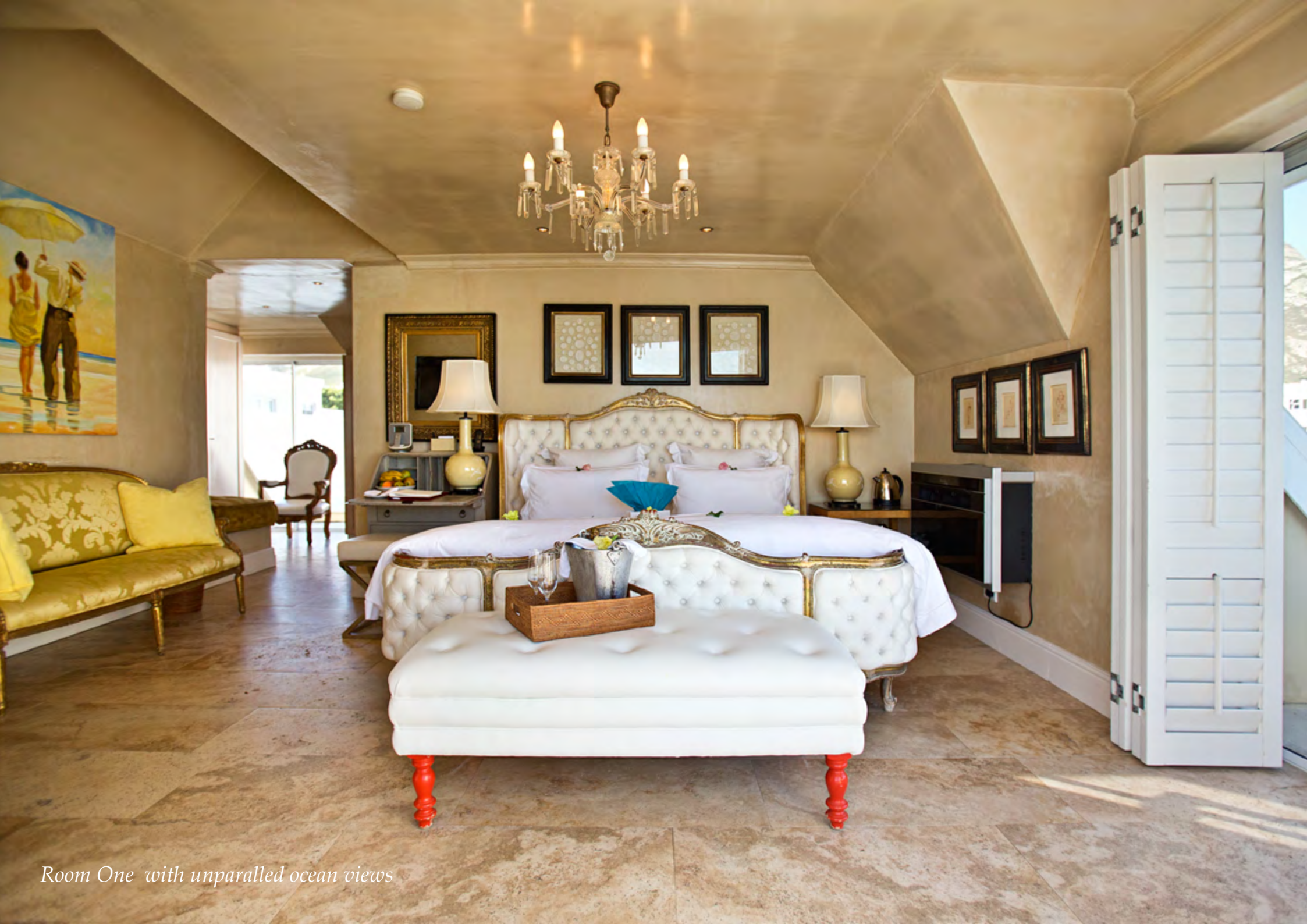
Room One with unparalleled ocean views