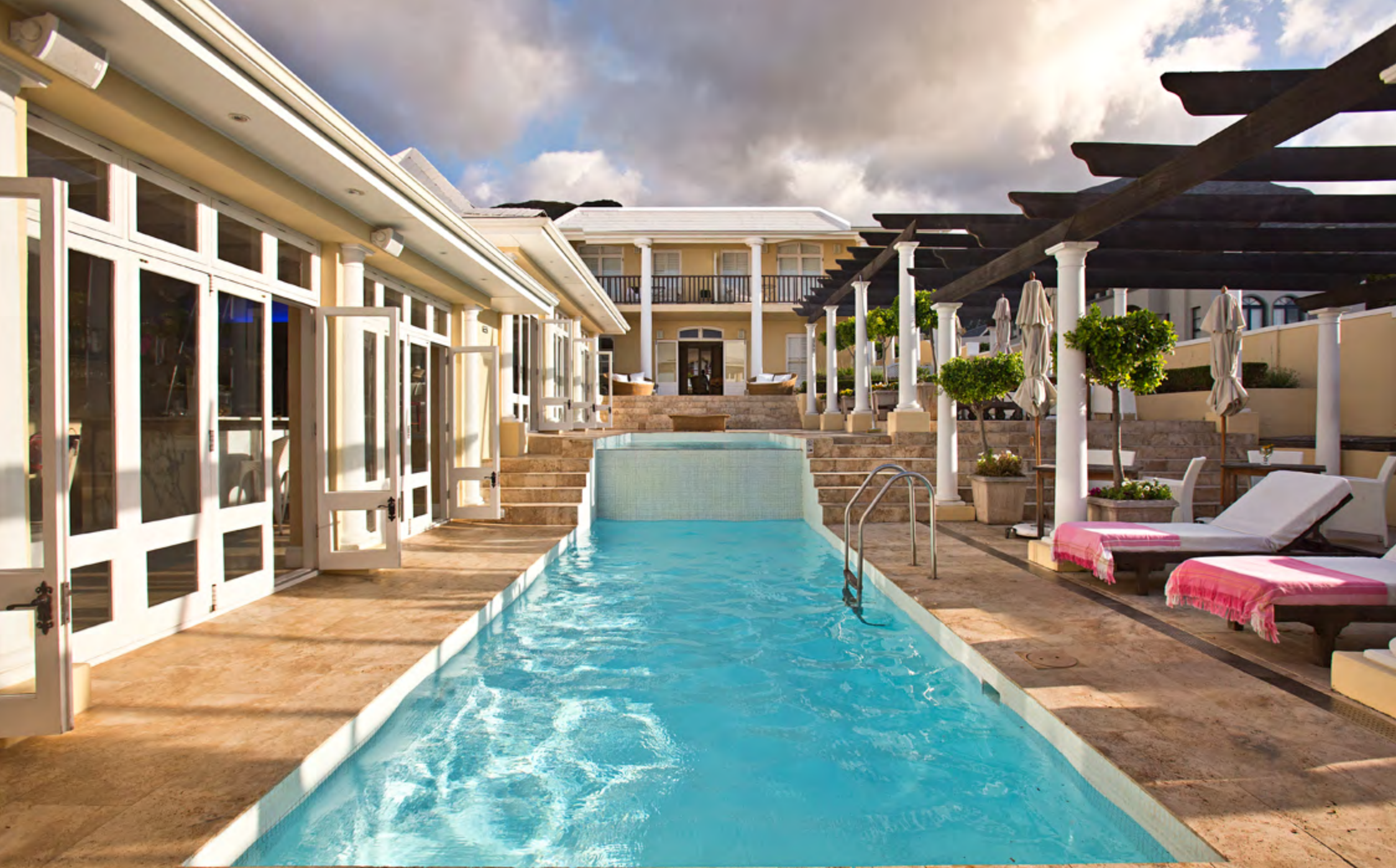
Leisurely lunches are served in the Birkenhead House courtyard.