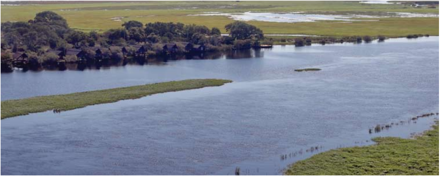
Chobe Water Villas nestles quietly under magnificent shading Acacia Trees