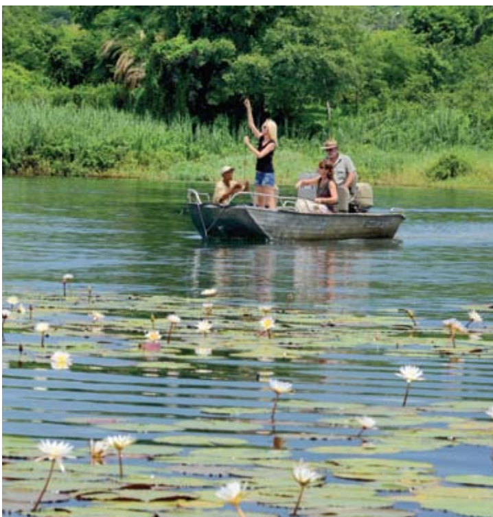
Fishing on the Chobe