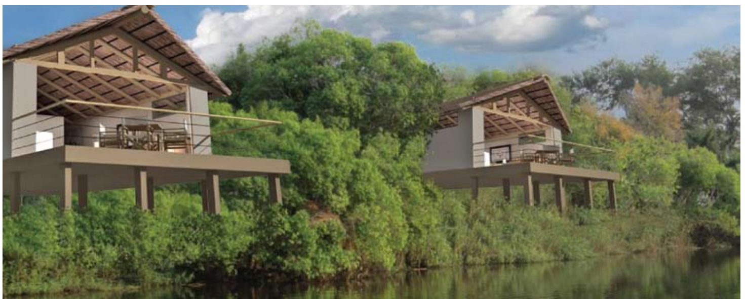
Chobe Water Villas overlooking the River