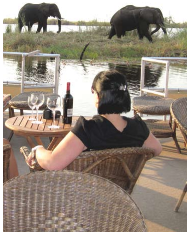
Relaxing sundowner on safari boat

Amenities include free Wi-Fi, Intercom Phone, Air-conditioning, and Tea & Coffee making stations, Mini-fridge, Hairdryer, Electronic Safe, multi 220v plugs