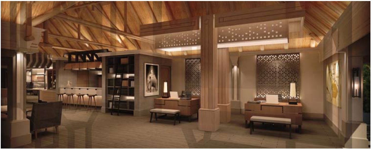
Reception and Activity desks