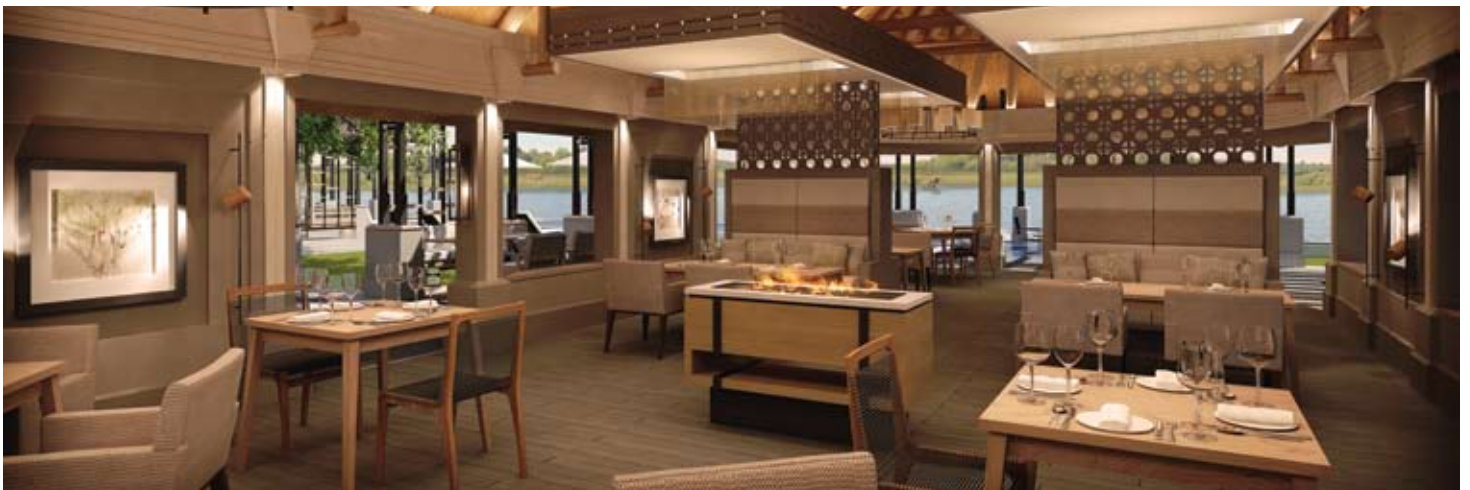
Chobe Water Villa Restaurant

Pool towels are provided in each Villa for use on the Sun-Loungers on the private terraces. Further towels are provided on the pool deck at the infinity pool.