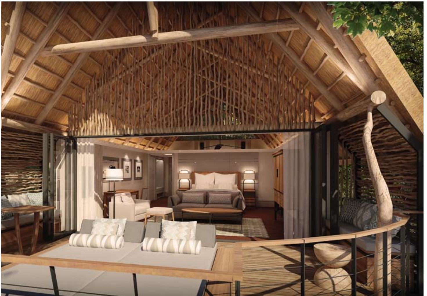
85 m 2 of indoor and outdoor luxury