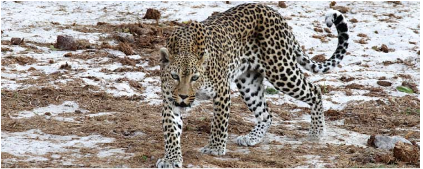
Leopard taking an afternoon walk