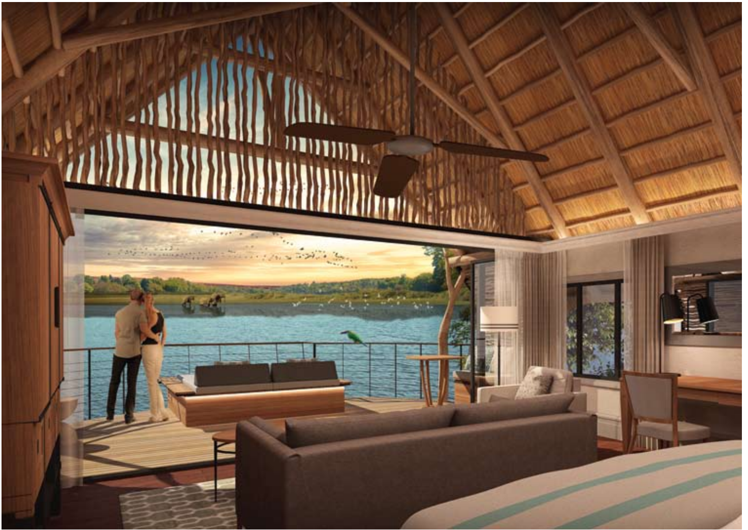
Inside Luxury Water Villa with spectacular 180° view