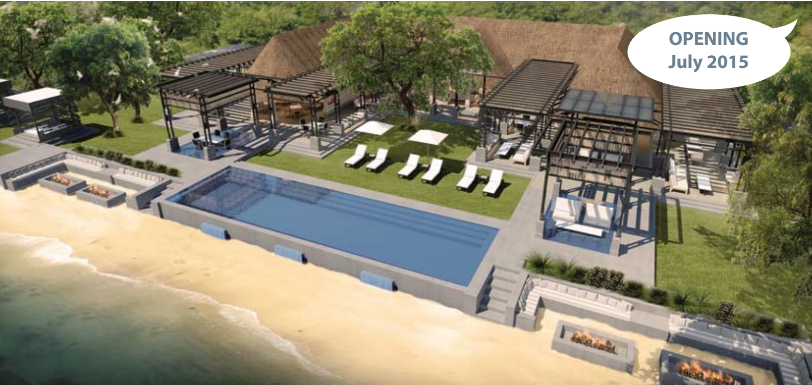
Chobe Water Villas, on the banks of the Chobe River