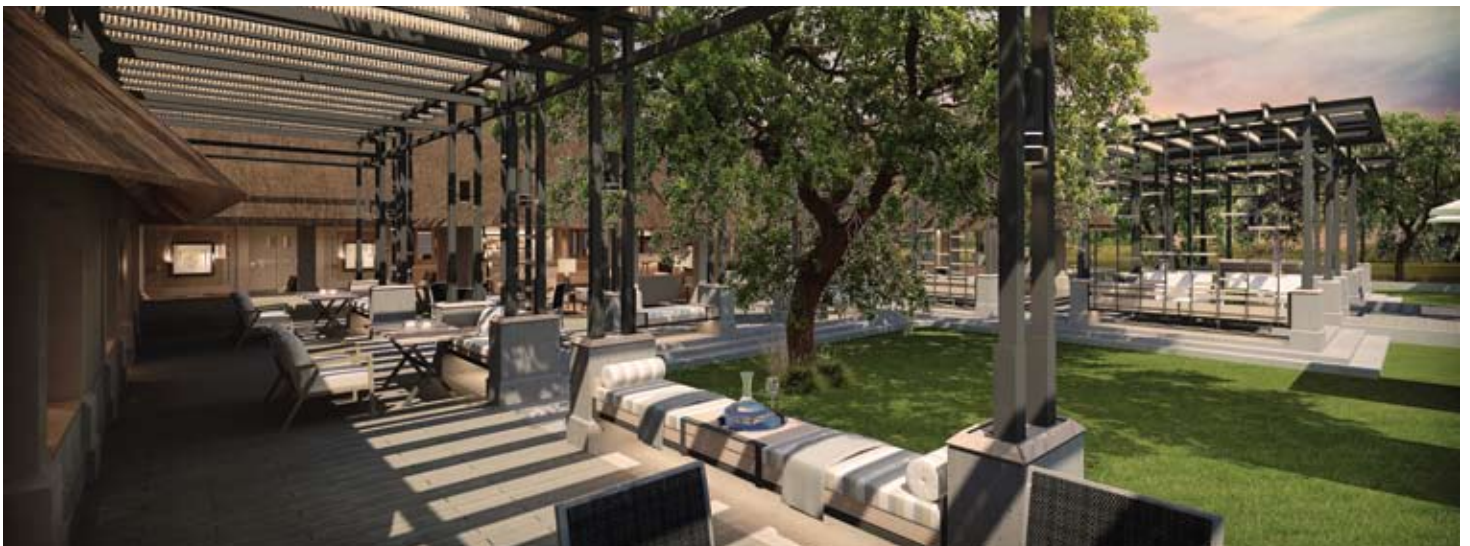
Restaurant, Bar and Lounge Garden Terraces at Pool Deck