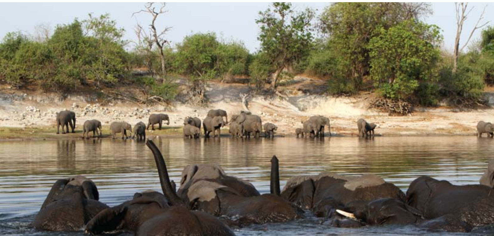
Elephants enjoying a bath in the Chobe River