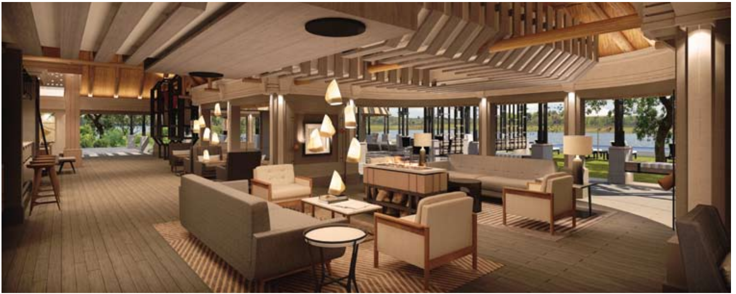
Bar & Lounge