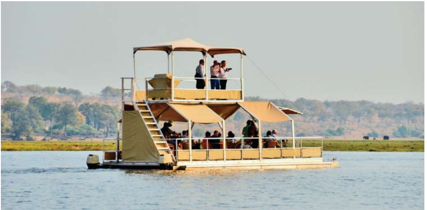
Chobe River safari by boat