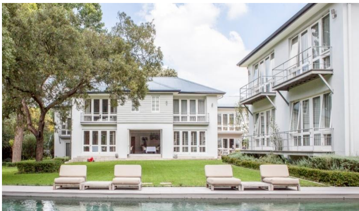
AtholPlace Boutique Hotel

90 Pretoria Ave (off Katherine Street), Atholl, Sandton, Johannesburg, South Africa Tel: +27 (11) 783 3410, Fax: +27 (011) 783 3350 reservations@atholplace.com, www.atholplace.com