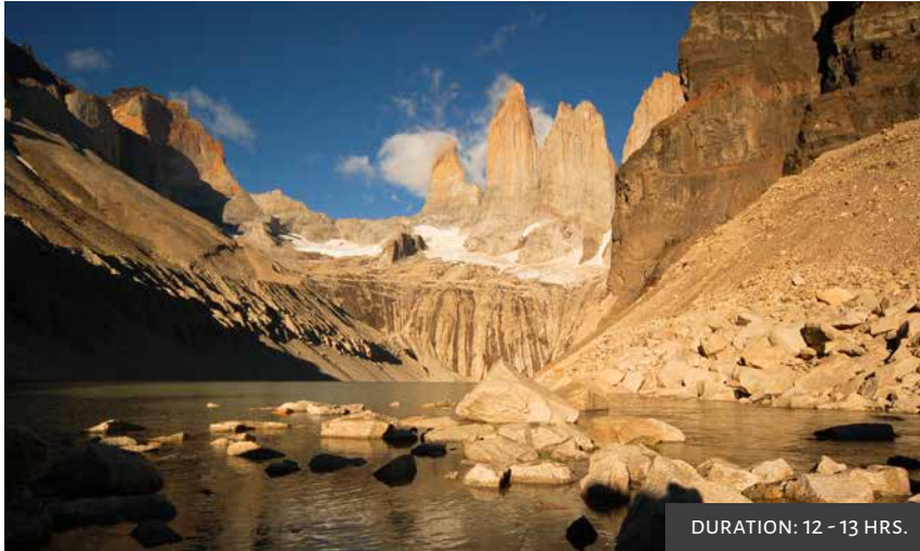
DURATION: 12 - 13 HRS.