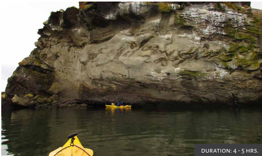
DURATION: 4 - 5 HRS.