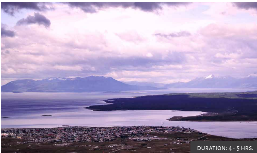
DURATION: 4 - 5 HRS.