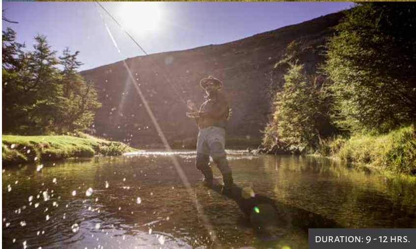
DURATION: 9 - 12 HRS.