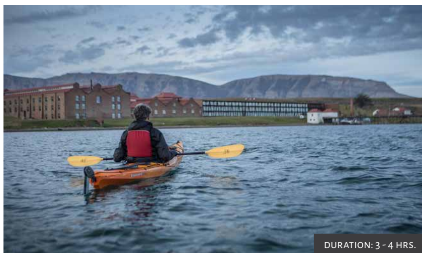
DURATION: 3 - 4 HRS.