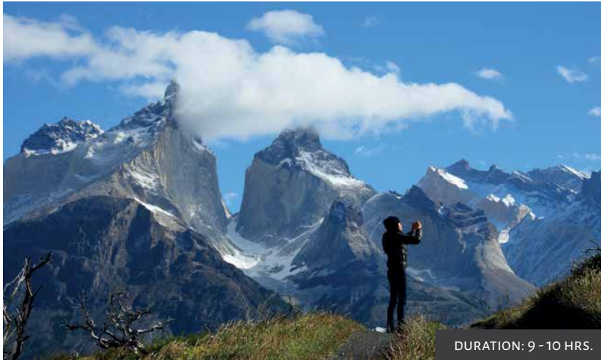
DURATION: 9 - 10 HRS.