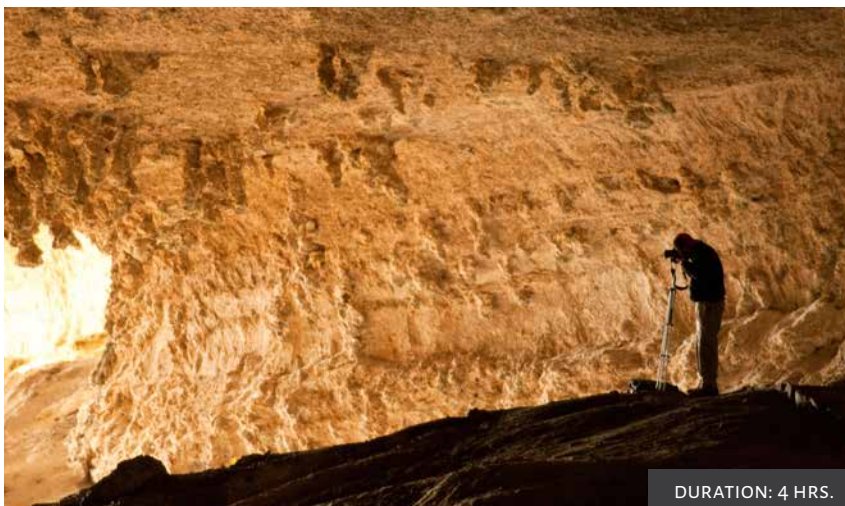
DURATION: 4 HRS.