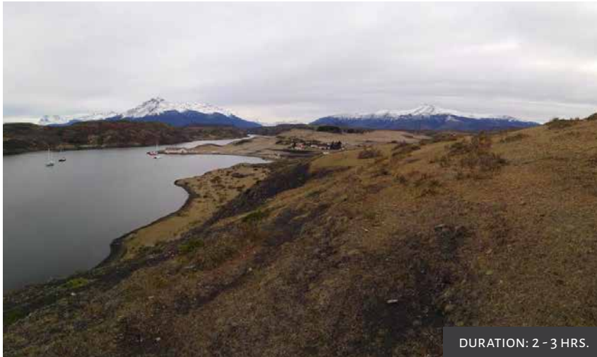
DURATION: 2 - 3 HRS.