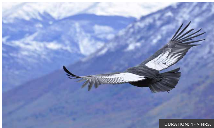
DURATION: 4 - 5 HRS.