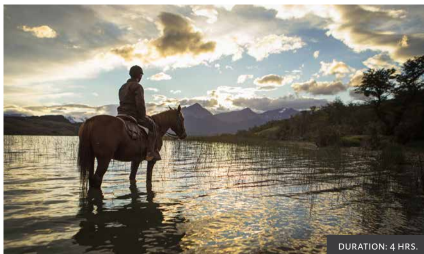
DURATION: 4 HRS.