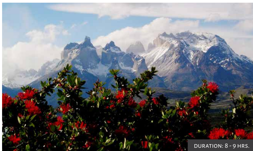
DURATION: 8 - 9 HRS.