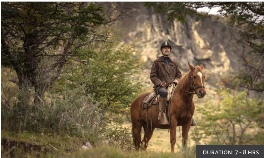
DURATION: 7 - 8 HRS.