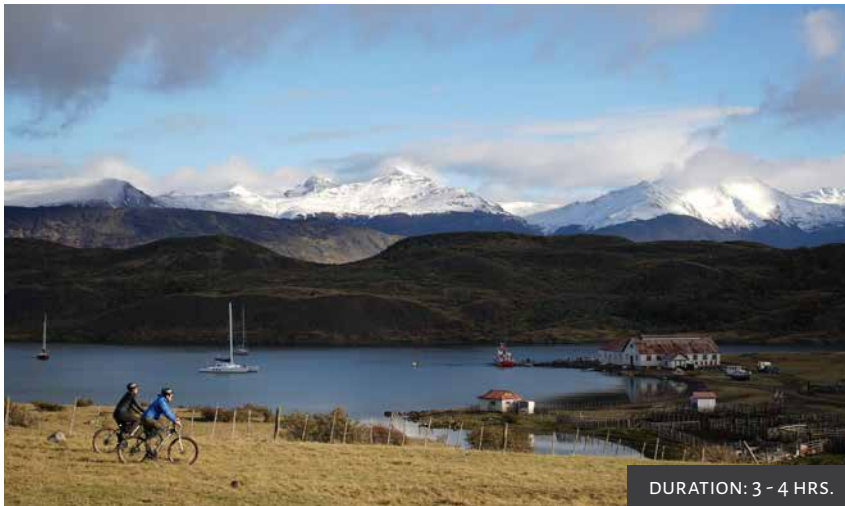
DURATION: 3 - 4 HRS.