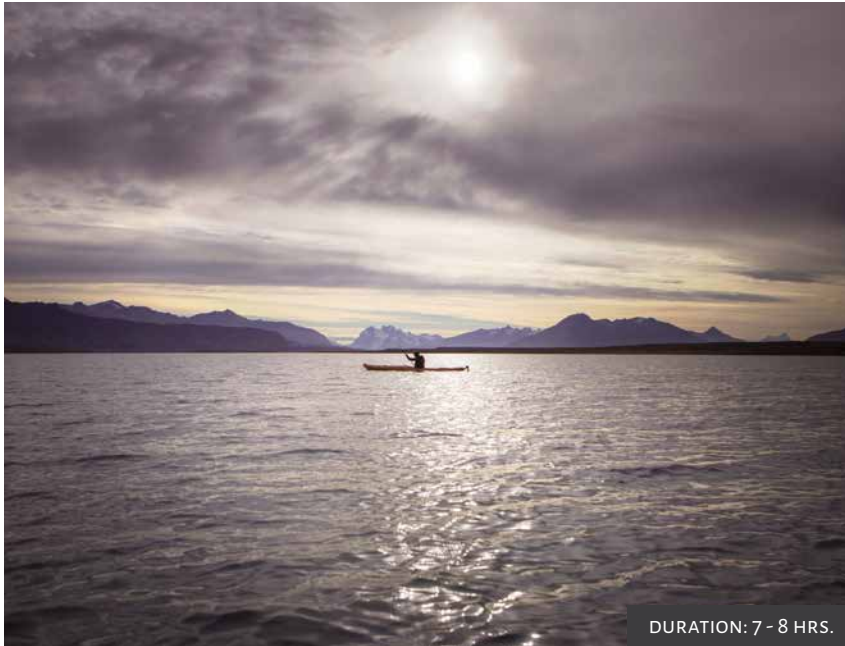
DURATION: 7 - 8 HRS.