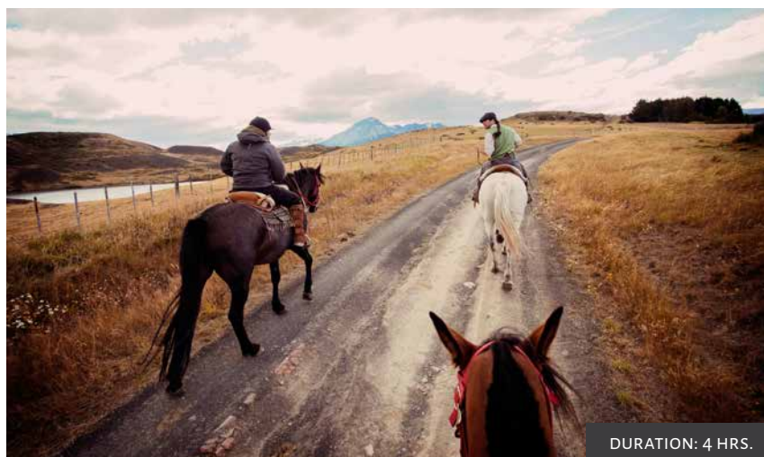
DURATION: 4 HRS.