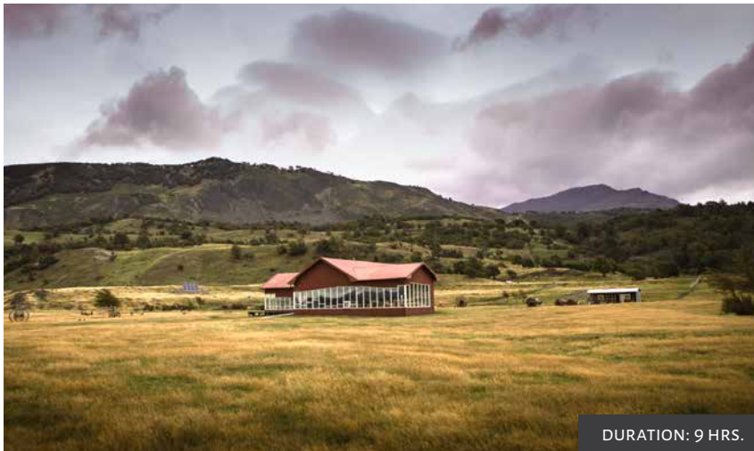
DURATION: 9 HRS.