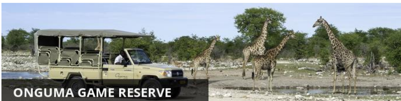
ONGUMA GAME RESERVE