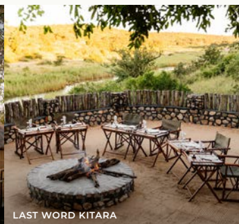
LAST WORD KITARA