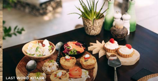
LAST WORD KITARA