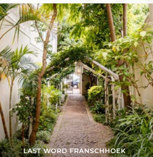
LAST WORD FRANSCHHOEK

Rates above for safari experience exclude conservation levies and fees and any items of a personal nature.