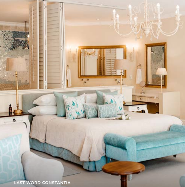
LAST WORD CONSTANTIA