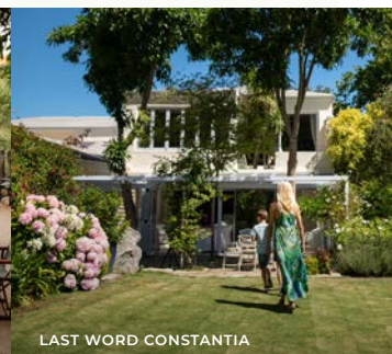
LAST WORD CONSTANTIA