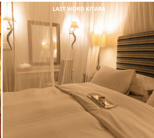
LAST WORD KITARA