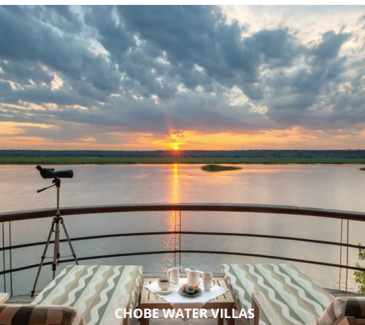
CHOBE WATER VILLAS

+260 965 156181 (WhatsApp) info@lioncamp.com www.lioncamp.com