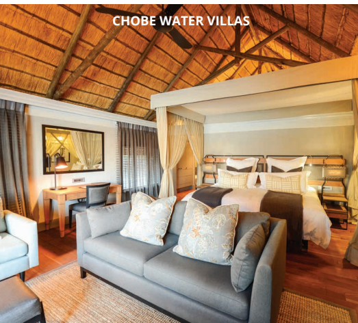
CHOBE WATER VILLAS