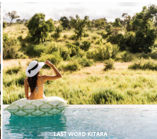
LAST WORD KITARA