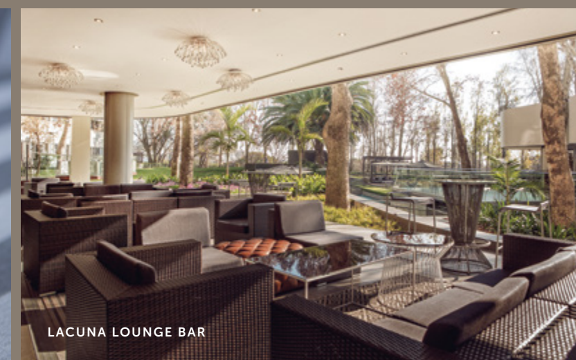
LACUNA LOUNGE BAR