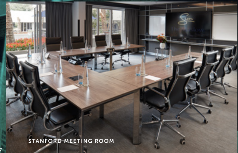
STANFORD MEETING ROOM

At The Maslow, every meeting room is designed to be a game-changer – a place that fosters success. Ranging from 24m 2 to 56m 2 , they are conducive to productive workshops, strategic thinking, effective team building and well-deserved relaxation. There is also a dedicated lunch and lounge area leading onto oasis gardens that offer alternative breakaway zones for meeting and dining opportunities.