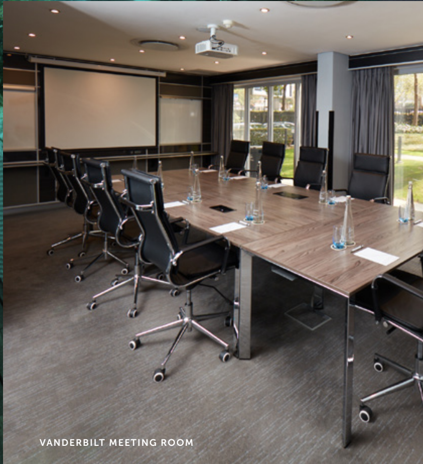
VANDERBILT MEETING ROOM