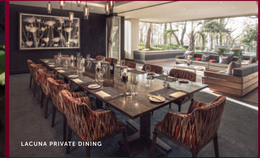
LACUNA PRIVATE DINING