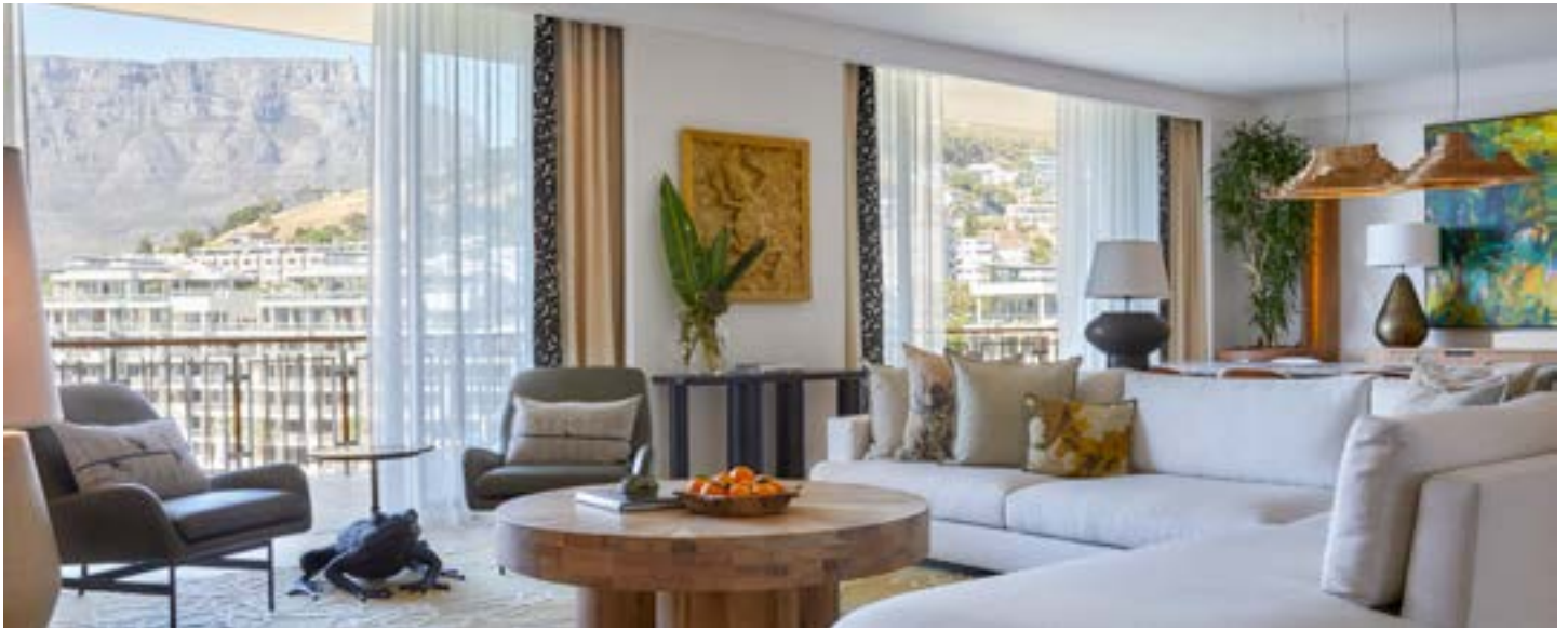
TABLE MOUNTAIN SUITE

Dramatic African artwork accentuates the foyer, large entertainment area and dining room in the one bedroom 316m 2 /3,401ft 2 Table Mountain Suite, located in the crescent-shaped Marina Rise. The suite also features an executive office, dedicated Guest Host, a personal gym and a magnificent terrace ensuring the perfect view, after which this suite takes its prided name. Guests are able to host private dinners or business meetings at the large, 10-seater dining room table as One&Only Cape Town's chefs* prepare gourmet meals in the fully-equipped kitchen. The suite has a luxurious and spacious ambience and includes an oversized bath, rain shower, private water closet and dual marble vanity.