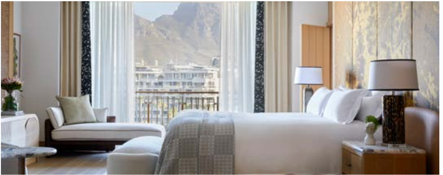
TABLE MOUNTAIN SUITE FLOOR PLAN