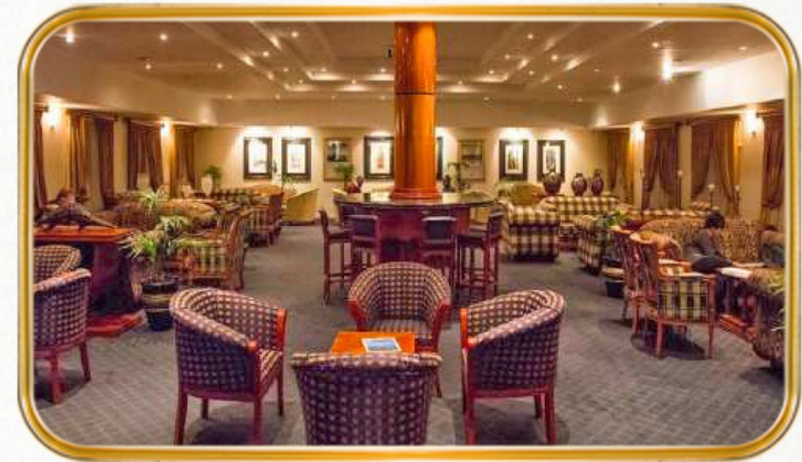
Pre-departure Lounge: Cape Town

The Pre-departure lounge in Pretoria is in the vicinity and is a few metres away from the Gautrain Pretoria Station. The Gautrain is South Africa's premier rapid rail and bus service which provides a fast, safe and cost effective link between O.R. Tambo International Airport (ORTIA) and nine key business hubs between Johannesburg and Tshwane (Pretoria), including Sandton. The Blue Train's Pre-departure Lounge in Cape Town is nestled up at Cape Town railway station, the main railway station of the 'Mother City', as the city of Cape Town is affectionately known.