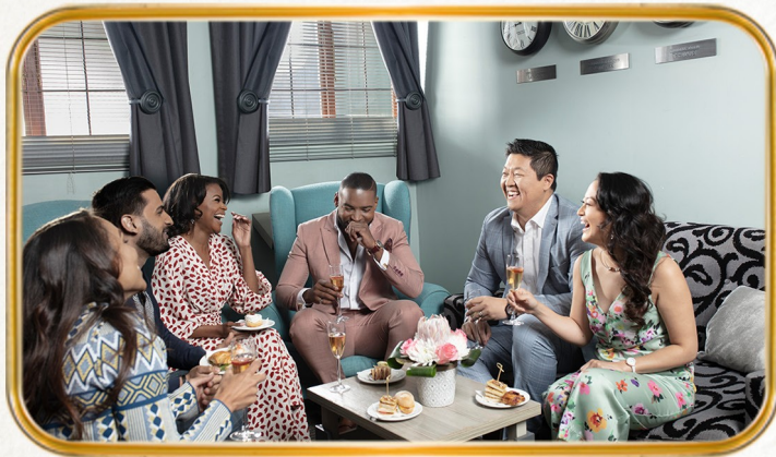
Pre-departure Lounge: Pretoria

Your holiday begins the moment you step into any of The Blue Train's VIP lounges situated at Cape Town and Pretoria stations. Check-in is from 12h00 and departure from Pretoria and Cape Town stations is at 14h00. Guests are requested to check-in at least two hours prior to departure. At the VIP lounges, guests will be kept captivated and entertained with a live performance by a saxophonist while they indulge in gourmet canapes, pre-departure snacks, alcoholic and non-alcoholic beverages.