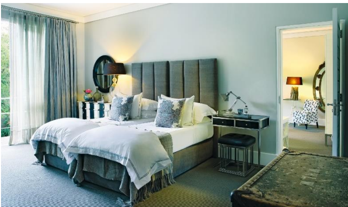
Deluxe Room (interleaving) – AtholPlace Hotel