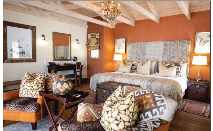
Luxury Island Suites