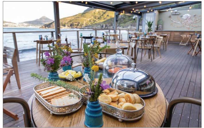
Chefs Warehouse Restaurant Deck