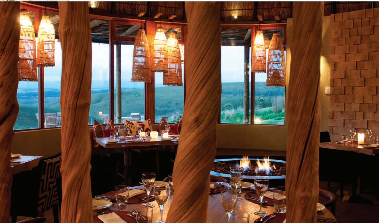
GONDWANA GAME RESERVE - GARDEN ROUTE - SOUTH AFRICA - www.gondwanagr.co.za