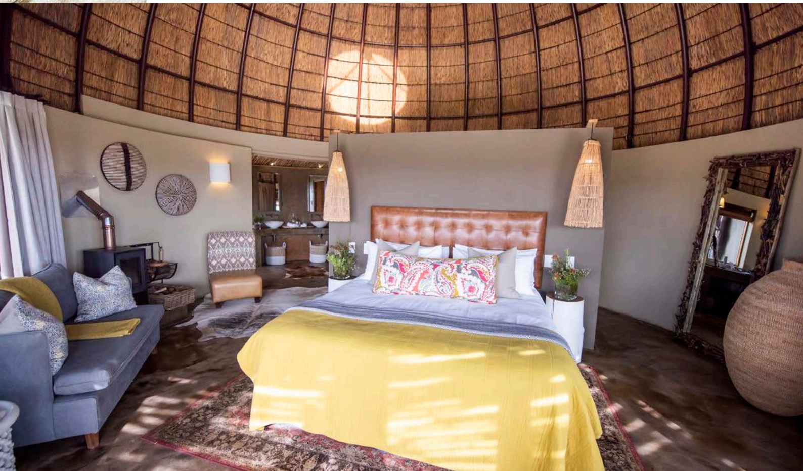
GONDWANA GAME RESERVE - GARDEN ROUTE - SOUTH AFRICA - www.gondwanagr.co.za