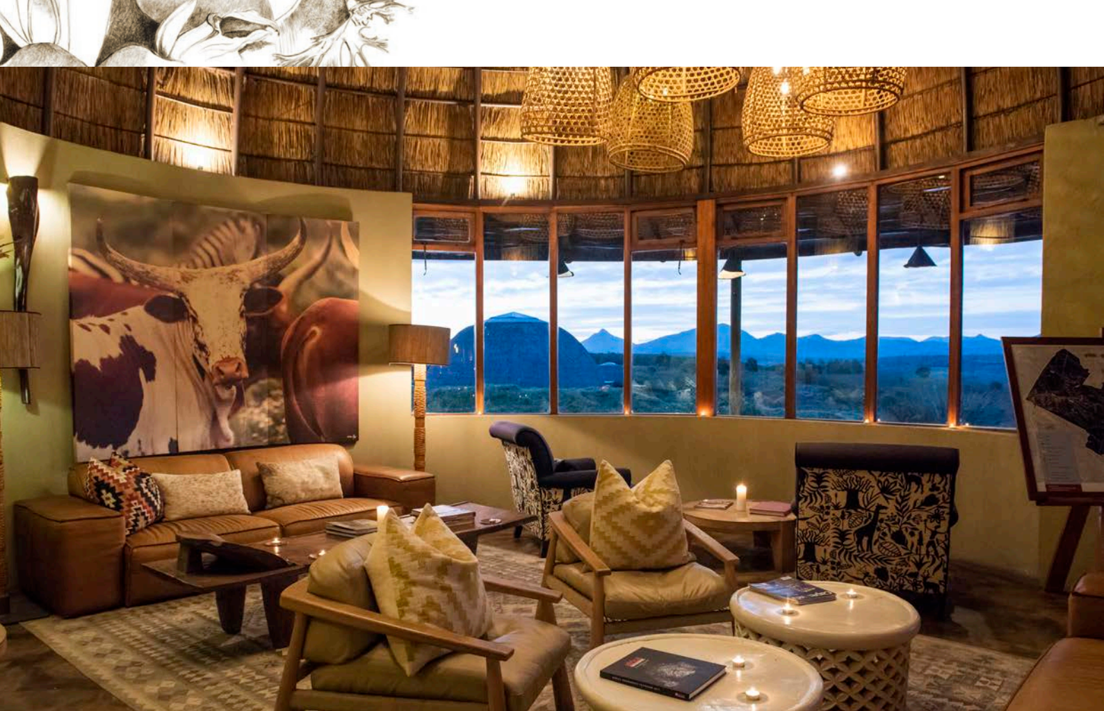
GONDWANA GAME RESERVE - GARDEN ROUTE - SOUTH AFRICA - www.gondwanagr.co.za